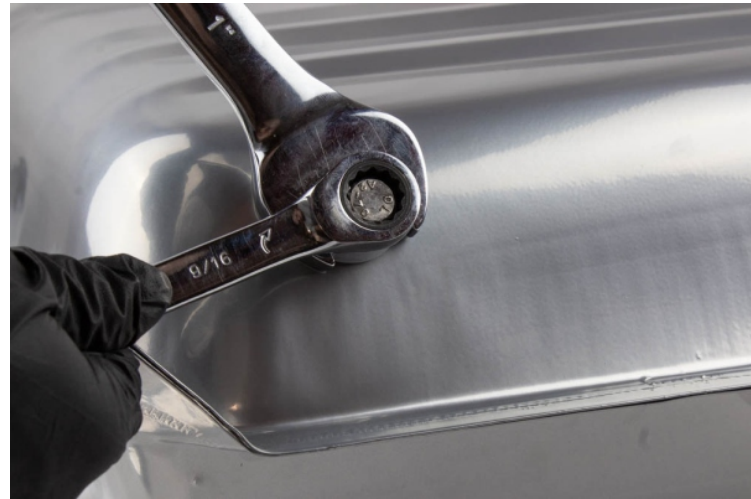
Twist bolt to collapse and set bung.