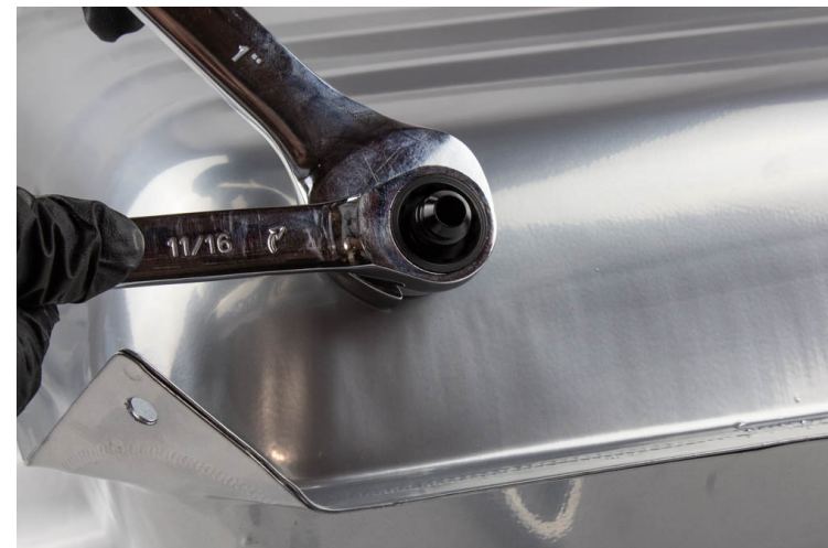
Install ORB fitting.