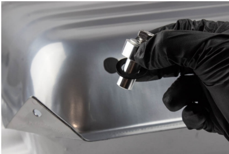
Insert fitting with gasket, screw and washer.

IMPORTANT NOTE: The fuel tank on your vehicle must be vented to avoid pressure building up inside the tank. Do not attempt to install and operate an EFI system without a properly vented fuel tank.